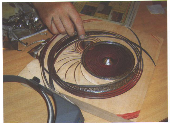
Nick Agar - work in progress