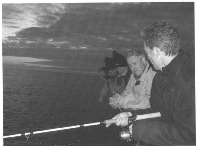
Extra curricular activities

*Editor's note: For those not in the know, as I was, an internet search reveals "rosemaling painting" to be something akin to what we know in this country as canal art.