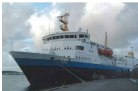
The new MS Gann used for the 2008 Cruise.