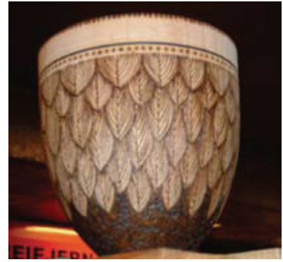
A nice turned and burned piece.