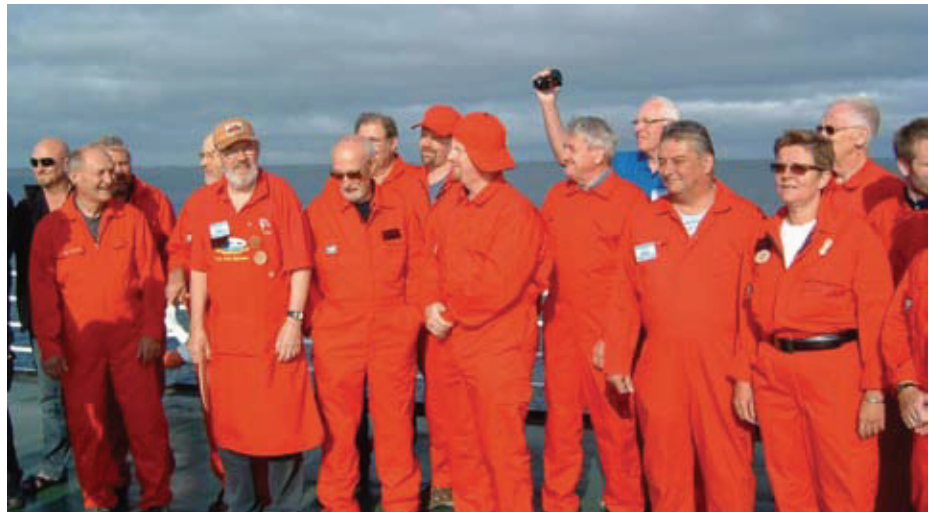
Demonstrators during the Norwegian Woodturning Cruise 2008.

e-mail: post@verktoyas.no www.woodturningcruise.com Tel: (47) 51 886800