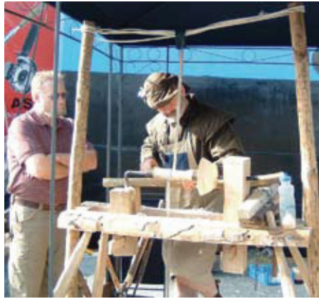
Pole Lathe on board.