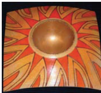
A nicely decorated square bowl.