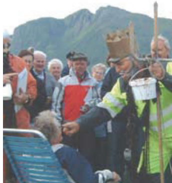
King Neptune anoints a passenger when crossing the Artic Circle.