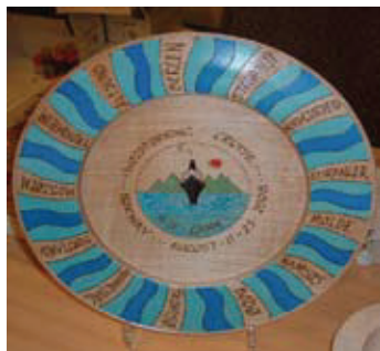
A commemorative plate.