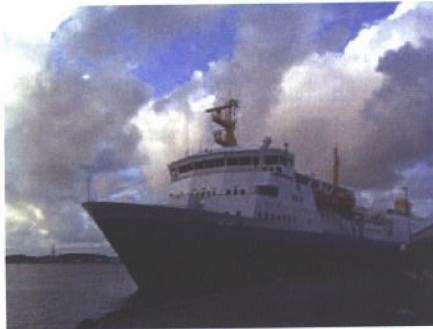
MS GANN in Stavanger before the cruise

Aboard the MS GANN nearly 200 passengers, including over 20 demonstrators, from 15 different countries, enjoyed a close relationship in a journey which started on 11th August 2008 in Stavanger.