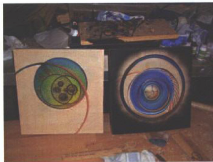
Nick Agar - Work in Progress