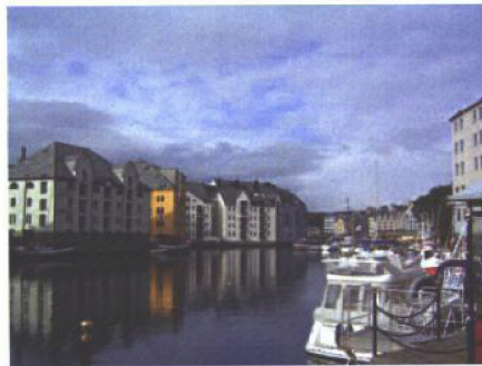
Alesund, above and Bergen, below