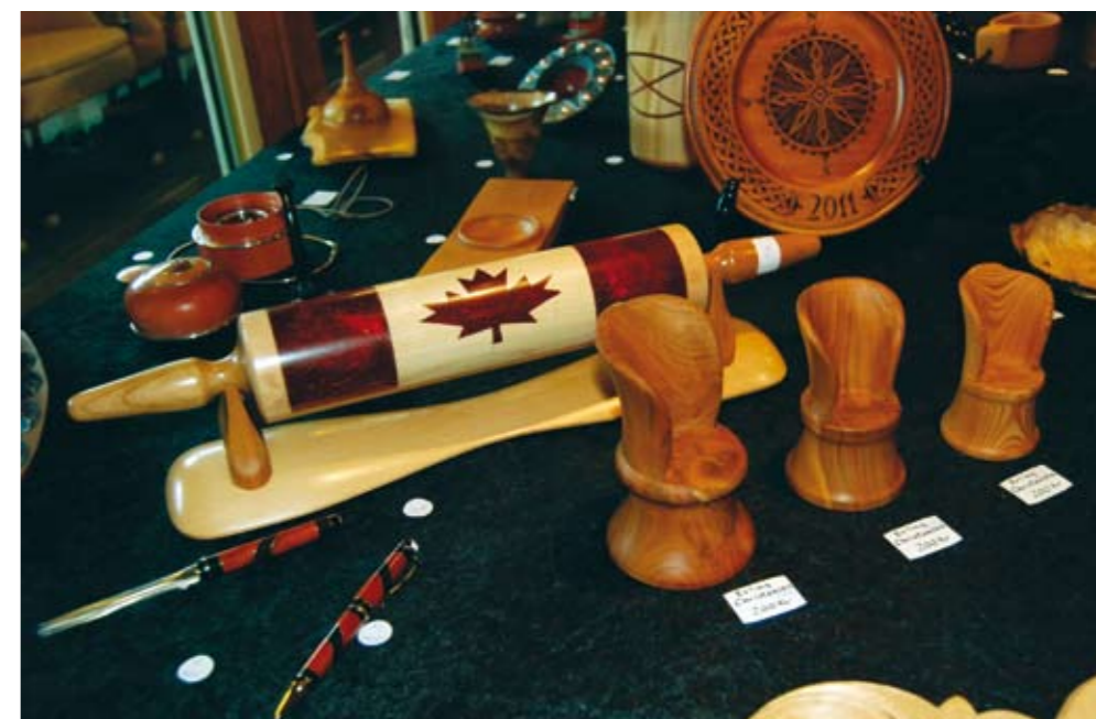
BELOW: Some of the pieces on display in the instant gallery

"To the astonishment of most of my friends, yes I was off on a woodturning cruise in Norway when they were sailing around the Caribbean. What a truly fantastic experience. A like-minded group of people aboard a ship specially modified with lathes, tools, accessory shop and manufacturer representatives. Daily woodturning demonstrations and tuition, knife making, chip and woodcarving tuition, scrollsawing, pyrography and felt making – a hit with the ladies. To top all this off was superb food, excursions every afternoon, and some of the finest demonstrators – this was absolute heaven to like-minded people. Talk eat and sleep craft, exchanging ideas and techniques, it was total bliss."