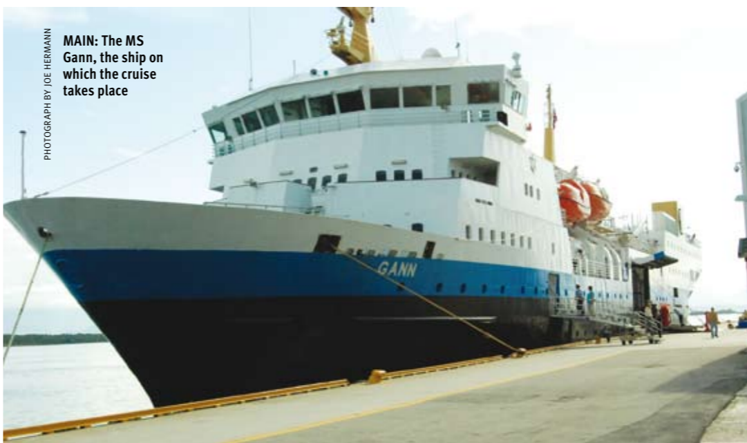
MAIN: The MS Gann, the ship on which the cruise takes place