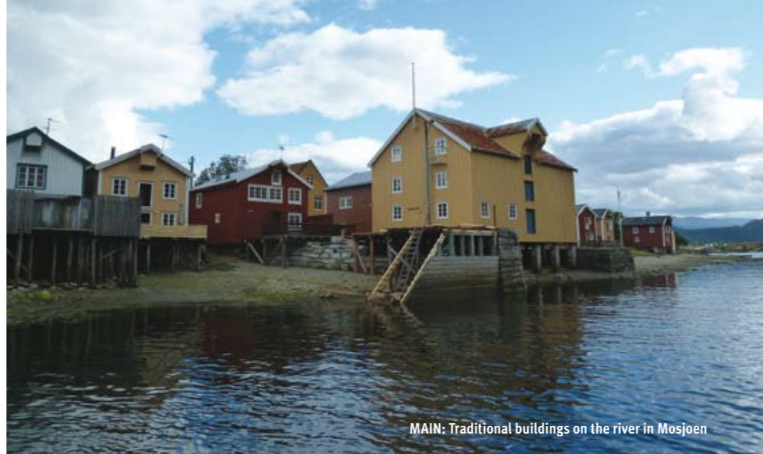
MAIN: Traditional buildings on the river in Mosjoen