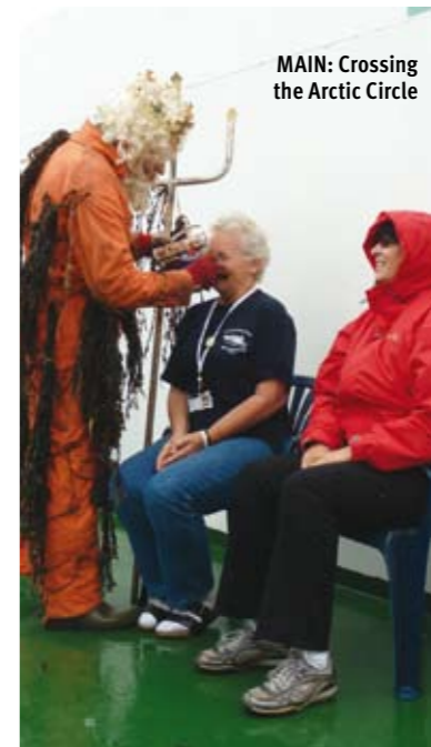
MAIN: Crossing the Arctic Circle