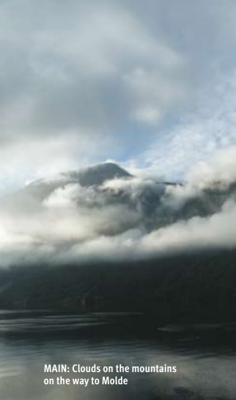
MAIN: Clouds on the mountains on the way to Molde