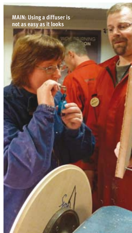
MAIN: Using a diffuser is not as easy as it looks